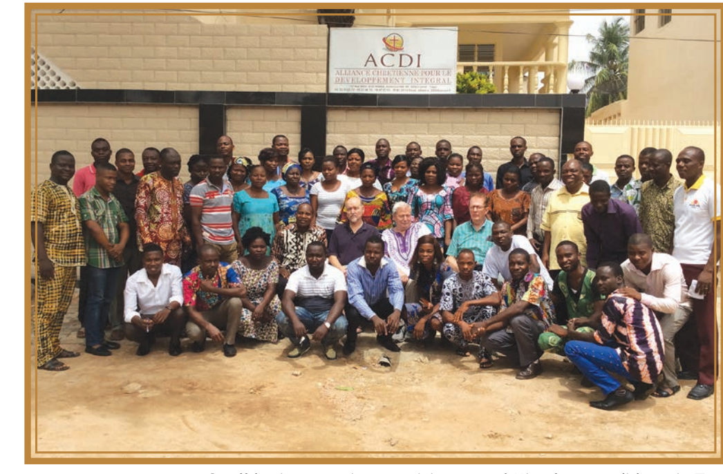
Small business seminar participants and Microloan candidates in Togo

There are over 50 Christian micro-entrepreneurs representing four regions where NHMI has convened in the city of Lomé, Togo for the seminar at NHMI/ACDI headquarter in Lomé. The response of the participants was overwhelmingly positive and the seminar was regarded by participants as one of the most important initial steps in empowering churches and communities for the spiritual growth and evangelistic outreach in West Africa. This seminar was taught by three retired American businessman from Carriage lane Presbyterian Church, of Peachtree city, Safe Harbor Presbyterian church of Marvland and Crossroads Presbyterian church from Delaware. During the seminar, they covered various topics including: